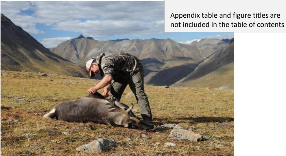
Figure A-2. Field dressing an injured agriban

Table and figure numbering correspond with each appendix letter