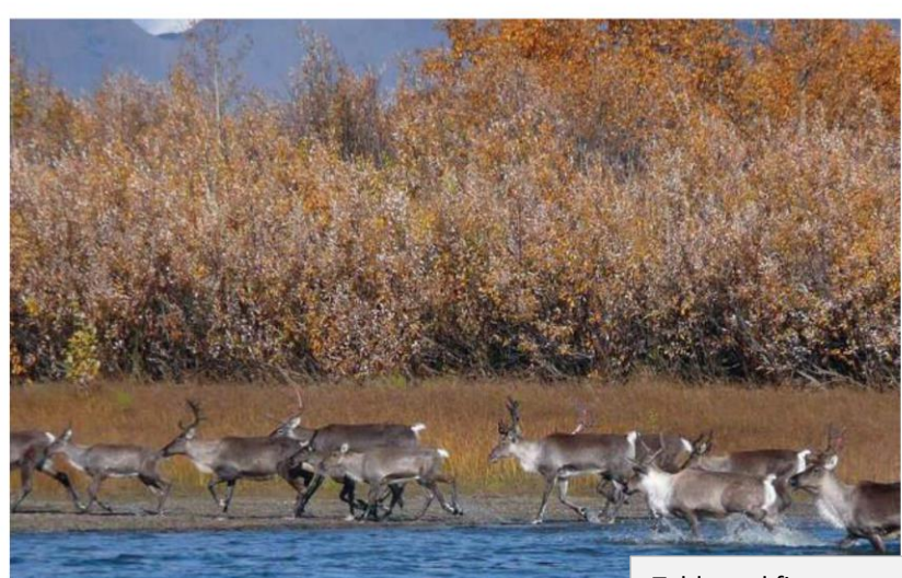
Figure A-1. Caribou crossing Colville River tributary

Table and figure numbering correspond with each appendix letter